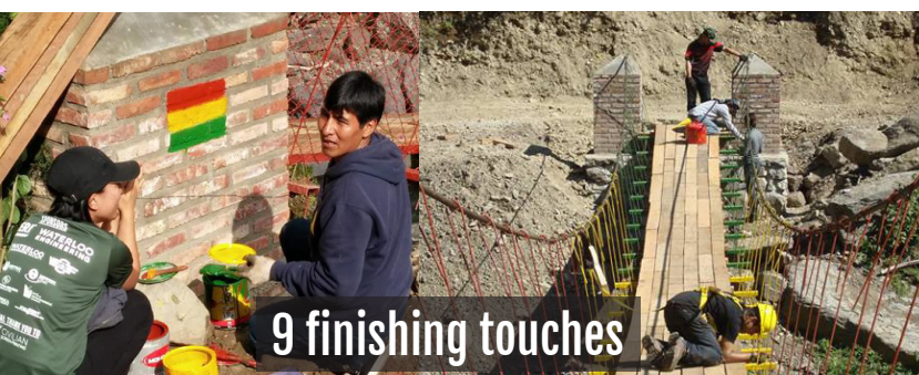
9 finishing touches