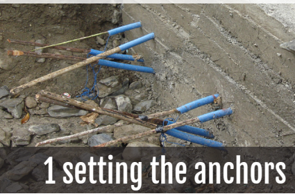
1 setting the anchors