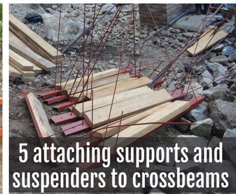
5 attaching supports and suspenders to crossbeams