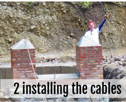
2 installing the cables