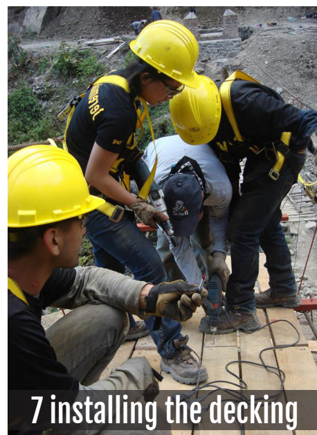
7 installing the decking