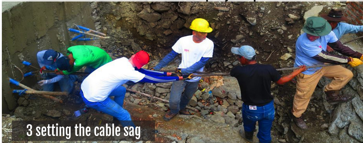
3 setting the cable sag