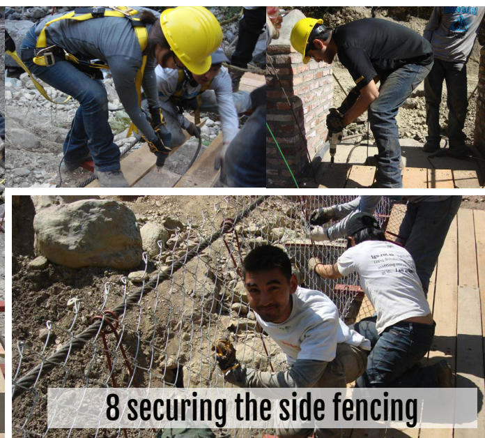
8 securing the side fencing