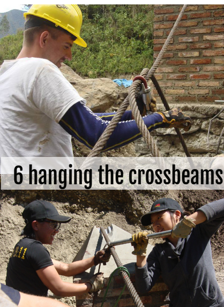
6 hanging the crossbeams